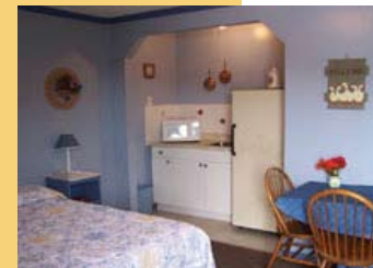
Efficiency Room with One Full Size Bed