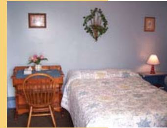
One Full Size Bed Guest Room