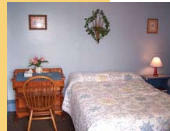
One Full Size Bed Guest Room